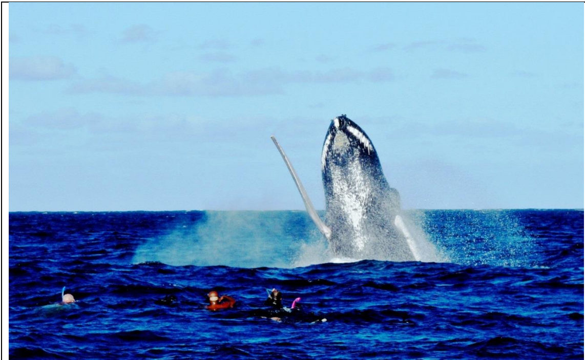
Escort whale breaching in front of our group. The author is the snorkeler on the far right.

In this lifetime, I had an experience similar to what Sri Hari experienced when Yeshua opened up his third eye. In 2011, I was swimming in the ocean with wild humpback whales off the coast of the Dominican Republic. Our group of snorkelers had been in the water watching a mother whale and her baby for hours. I was sending an energetic cord of love to this beautiful forty-five-ton mammal, when suddenly I experienced the popping of a bubble of limitation that had been around me all my life—so I had never noticed it. I felt as if I had been a fish swimming around inside a small fishbowl, and suddenly the fishbowl disappeared and I was free to explore the whole ocean. At the same time, I got a strong telepathic message from the whale asking me to call her Minerva and telling me, “Be all you can be!” This message is not just for me, it is for all of us humans.