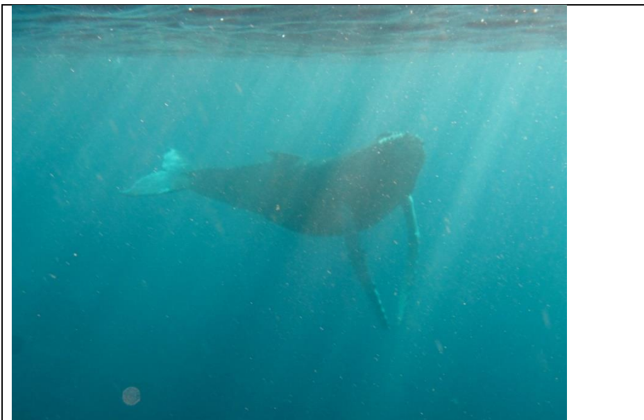
Newborn whale calf with an orb of light in lower left corner of photo

Swimming with the whales felt magical and exhilarating. The following underwater photograph is one of the baby whales our group swam with. Note the orb of white light in the photo. Perhaps these orbs are higher dimensional beings giving us a glimpse of their presence!